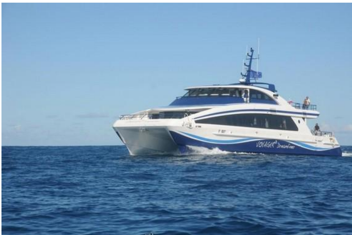
« Voyager3 » Fast crew Catamaran 30m