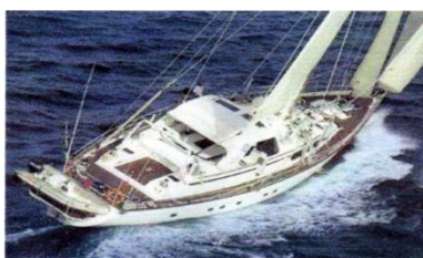
S/Y « Pearl Allegro » (CIM maxi 98')