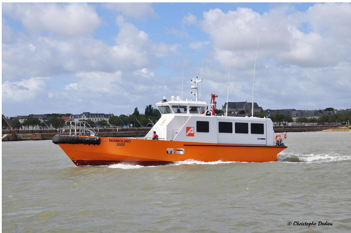
Mamolino Fast crew boat 20m