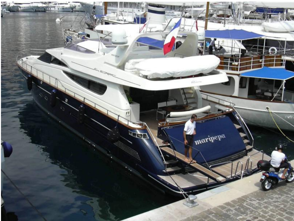
M/Y « Maripepa » ( Riva 85' )