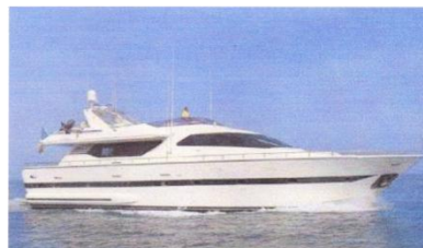
M/Y « Las Brisas » (San Lorenzo 82')