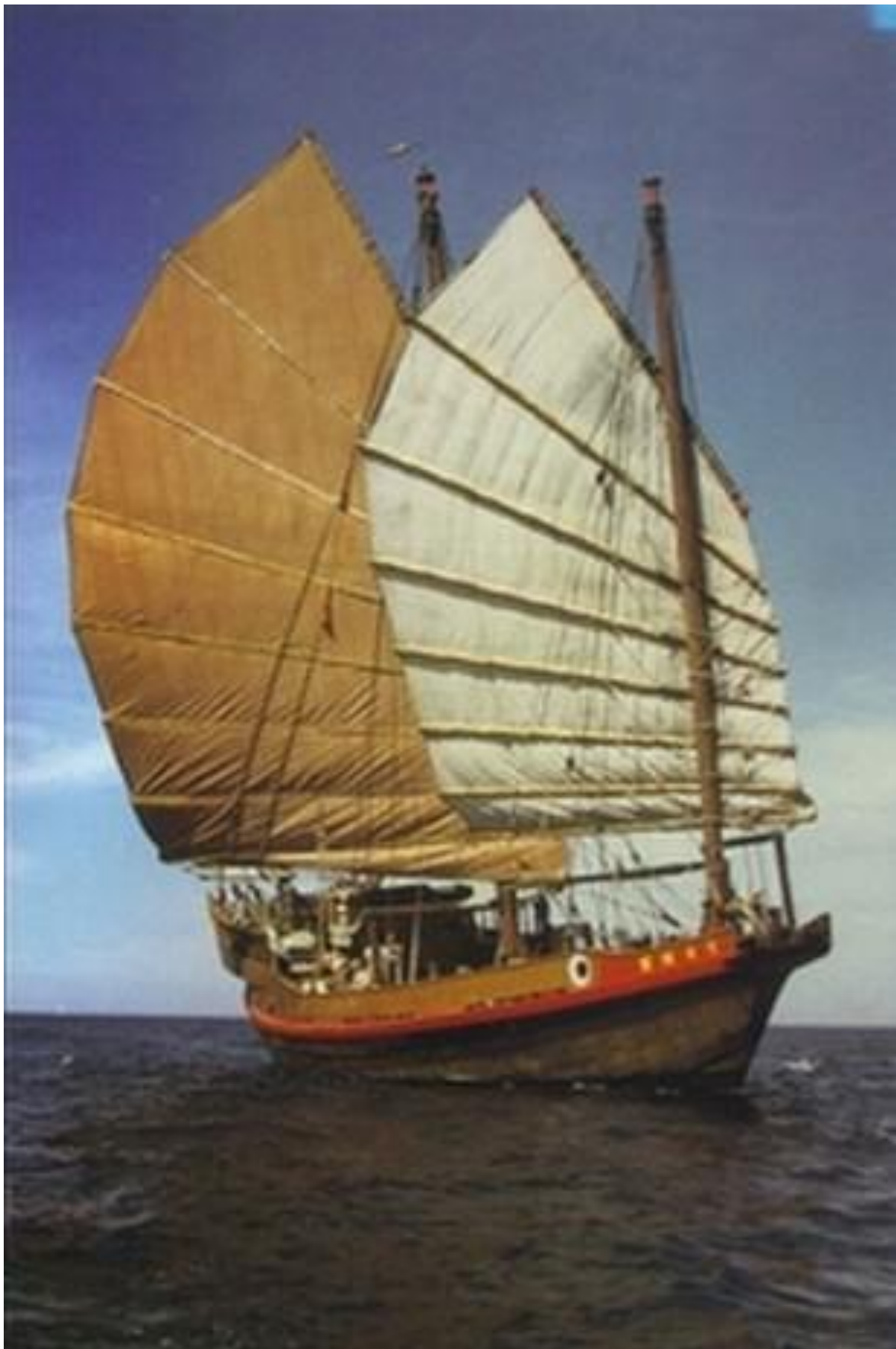
« Dame de Canton » Jonque 25m